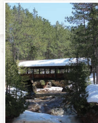
Amnicon Falls during the spring thaw.